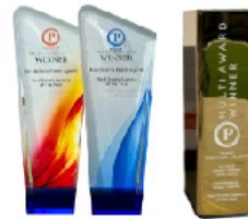
Real Estate Agency Of The Year Spain 2021/22 - 2022/23 - 2023/24